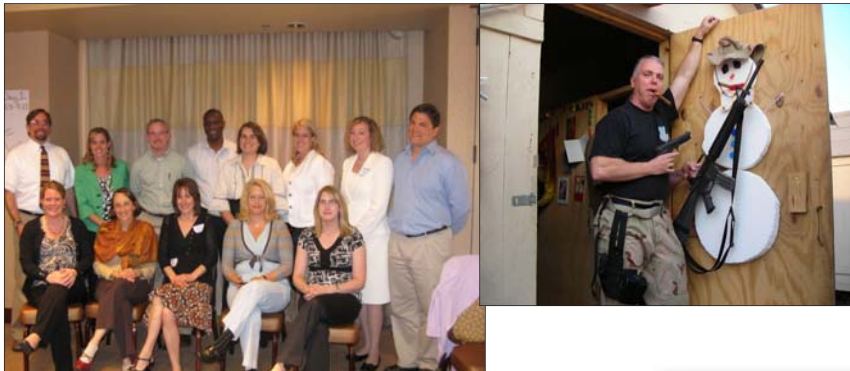
CDP Staff